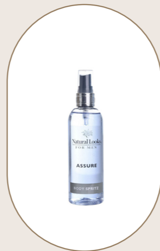
Assure Body Spray 150ml - 5.1fl.oz