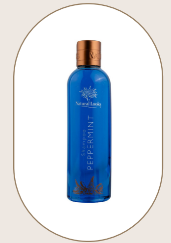
Peppermint Shampoo 250 ml - 8.5 fl.oz

A gentle Shampoo featuring the natural lightening qualities of Chamomile will help to gently lighten and brighten your hair. The soothing qualities make it ideal for sensitive scalps.