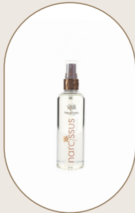
Narcissus Body Spray 150ml - 5.1fl.oz