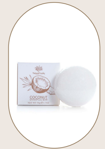
Coconut Shampoo Bar 50g - 1.7 oz

A fabulous shampoo with a fresh citrus fragrance in a convenient bar which is long lasting, easy to carry and won't leak or spill. Contains Dead Sea salt to absorb oils and add volume, perfect for hair that's oily or flat-looking.