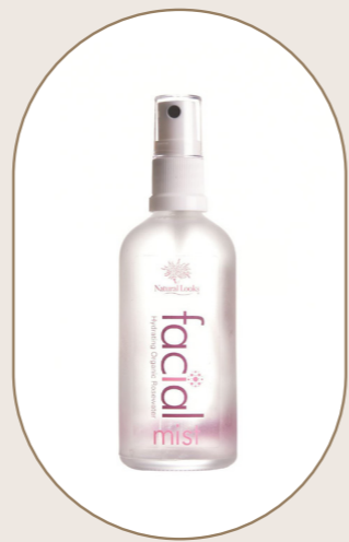
Facial Mist Hydrating Rosewater 20 ml - 0.68 fl.oz

Ageless Appearance Revolutionary lightweight serum that promotes a dramatically smooth ageless appearance. Using Swiss apple stem cell technology to assist in natural skin cell renewal and hydration.