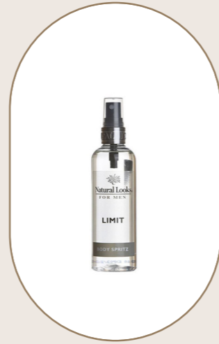
Limit Body Spray 150ml - 5.1fl.oz