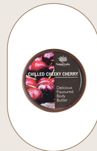
Chilled Cheeky Cherry Delicious Body Butter 60 ml - 2 fl.oz

This delicious flavoured massage oil is full of natural oils to make your skin irresistibly soft and silky. Apply liberally and massage into the skin.