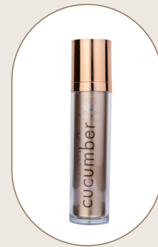
Cucumber Facial Toner 100 ml - 3.4 fl.oz

Unique formulation containing aloe vera, spotted geranium and fennel extracts to slow ageing by reducing fine lines, boosting hydration, and enhancing cell vitality.