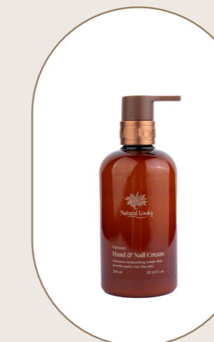
Paris Hand & Nail Cream 300 ml - 10.14 fl.oz

Intensive moisturising cream that absorbs easily into the skin Apply regularly to moisturise and lock in hydration for soft, smooth hands and stronger nails.