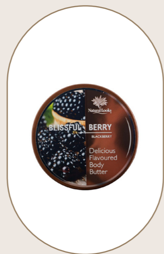
Blissful Berry Delicious Body Butter 250ml/100ml - 8.5/3.4fl.oz

Creamy moisturising body butter enhanced with luscious bubblegum flavour. Add fragrance and softness to your skin and create a luxurious sensuous experience.