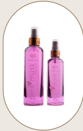
Pink Musk Body Spray 250ml/150ml - 8.5/3.4fl.oz