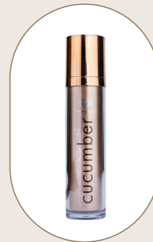
Cucumber Facial Cleanser 100 ml - 3.4 fl.oz

Cleansers, facial washes, and make-up removers are crafted to suit various skin types, providing gentle yet effective cleansing. For combination and oily skin, refreshing formulas help remove daily grime and make-up without the need for harsh scrubbing or irritation. For normal to dry skin, hydrating cleansers work to retain moisture while cleansing thoroughly. For acne-prone skin, specialized cleansers focus on clearing pores, reducing excess oil, and addressing blemishes without over-drying. Additionally, make-up removers are designed to easily remove even waterproof products while soothing and refreshing sensitive areas like the eyes.