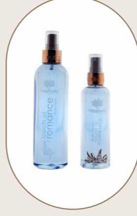
Touch of Romance Body Spray 250ml/150ml - 8.5/3.4fl.oz