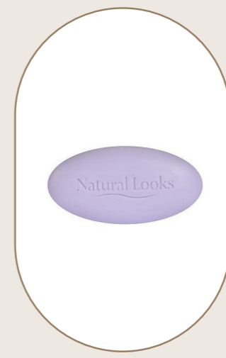
Lavender Soap 150g

This beautiful rosewater vegetable milled soaps with added oats to provide gentle exfoliation of the skin.