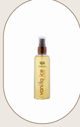
Vanilla Ice Body Spray 150ml - 5.1fl.oz