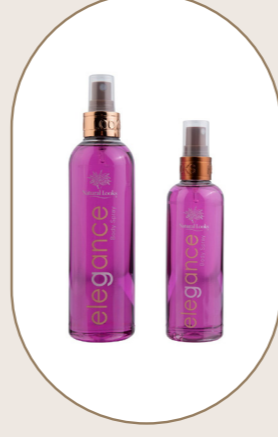
Elegance Body Spray 250ml/150ml - 8.5/3.4fl.oz