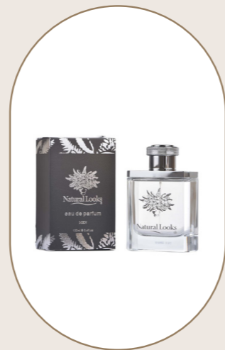
Freedom Eau De Parfum 100 ml - 3.4 fl.oz

A cool fragrant Balm rich in natural Extracts to help soothe small abrasions, aid quick healing and calm irritated skin. Apply liberally to skin after shaving.