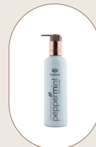
Peppermint & Cucumber Foot Lotion 250 ml - 8.5 fl.oz

For foot care, peppermint and cucumber-infused products provide refreshing relief to tired feet, helping to soften skin and combat odour. These products work synergistically to revitalize, soothe, and protect the feet while promoting overall skin vitality.