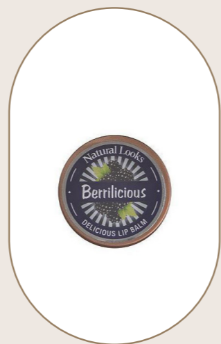
Berrilicious Delicious Lip Balm 10 ml - 0.34 fl.oz

Creamy moisturising body butter enhanced with luscious blissful berry flavour. Add fragrance and softness to your skin and create a luxurious sensuous experience.