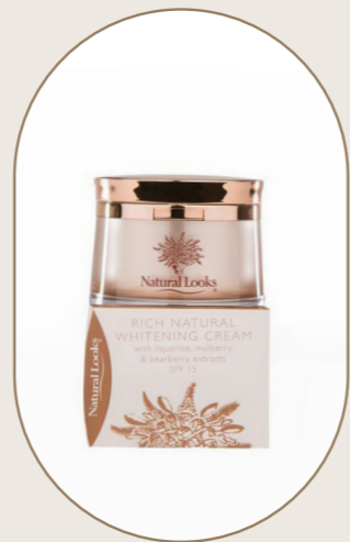
Natural Whitening Rich Cream 50 ml - 1.7 fl.oz

This multi-tasking formula helps reduce signs of aging. It improves skin texture and elasticity, promotes an even skin tone, and enhances collagen production.