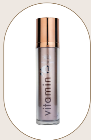
Vitamin E Moisturiser 100 ml - 3.4 fl.oz

A non-greasy moisturiser with refreshing natural Cucumber Extract and an added sun protection to help keep your skin soft and young looking. Suitable for combination/oily skins.