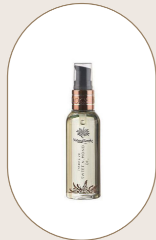
Sweet Almond Oil 75 ml - 2.5 fl.oz

Due to its emollient and non-irritating properties, this oil is suitable for all skin types. Especially good for chapped hands, for general massage and as a carrier oil.