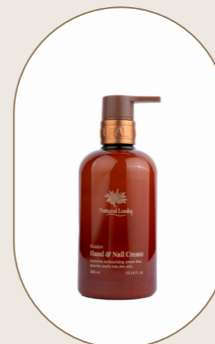
Illusion Hand & Nail Cream 300 ml - 10.14 fl.oz

Wet Hands, lather up, and rinse away for clean, soft hands that smell divine. Deep cleansing gel that moisturises and leaves your hands silky soft.