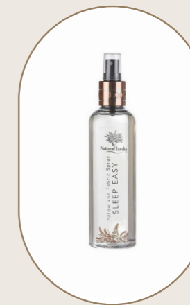
Sleep Easy Pillow & Fabric Spray 250 ml - 8.5 fl.oz