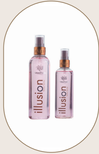
Illusion Body Spray 250ml/150ml - 8.5/5.1 fl.oz

This easily absorbed lotion contains soothing bamboo shoot extract with natural anti-oxidants to boost youthful radiance. Use daily to moisturise your body and maintain healthy skin.