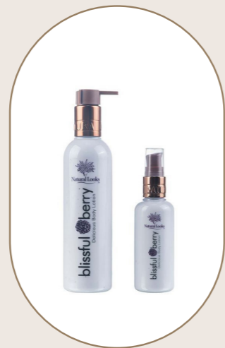
Blissful Berry Delicious Body Lotion 250ml/100ml - 8.5/3.4fl.oz

Delicious berry fruit flavoured moisturising lotion is full of natural oils to make your skin irresistibly soft and delectable.