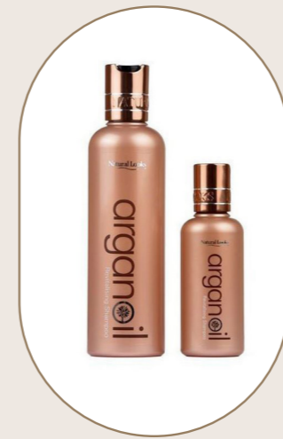
Argan Oil Revitalising Shampoo 250ml/100ml- 8.5/3.4fl.oz

A gentle shampoo that cleanses without stripping your hair of natural oils, restoring life and vitality to all hair types. Contains natural Aloe Vera which helps cool and soothe itchy or irritated scalps.