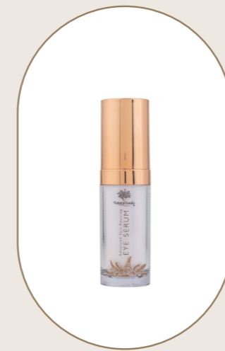
Eye serum Advanced Skin Reviving 20 ml - 0.68 fl.oz

Contains powerful anti-oxidants and conditioners which help reduce fine lines and firm the skin around your eyes, as well as targets puffiness.