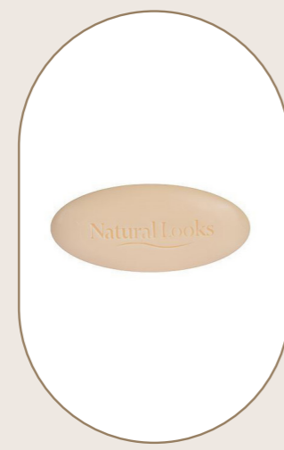
Chamomile Soap 150g

A gorgeous creamy vegetable soap which is gentle on the skin helping to retain moisture and protect from over drying. It is especially formulated to be caring to the skin with a sensuous light fragrance.