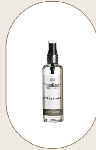
Mysterious Body Spray 150ml - 5.1fl.oz