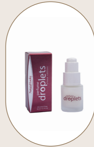
Clean Cotton Perfume Droplets 20 ml - 0.7 fl.oz

Discover the ultimate on-the-go fragrance experience with these alcohol-free, perfumed moisturising droplets. Formulated for quick absorption, these droplets leave your skin feeling hydrated while enveloping you in a delicate scent. They are perfect for travel or daily use, ensuring you can refresh your fragrance anytime, anywhere. Each droplet not only nourishes but also perfumes your skin, offering a luxurious aromatic experience no matter your destination.