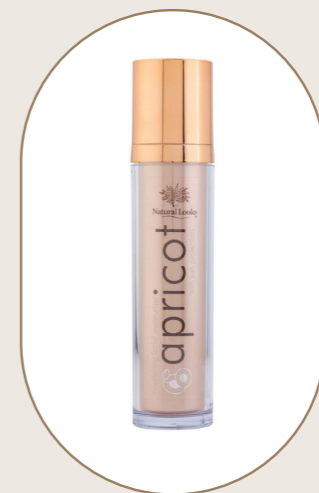
Apricot Moisturiser 100 ml - 3.4 fl.oz

A gentle Moisturiser with Jojoba Oil and calming Chamomile extract plus a sun protection to help keep your skin looking soft and young