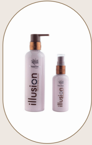
Illusion Hand & Body Lotion 250ml/100ml - 8.5/3.4fl.oz

Body serum hydrates dry skin and increases moisture retention with no oily residue. Bamboo shoot extract offers anti-irritant properties and anti-oxidants which boost a youthful radiance.