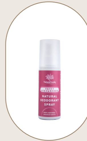
Sweet Strawberry Natural Deodorant Spray 100 ml - 3.4 fl.oz

This Crystal Deodorant is a totally natural mineral salt with antiseptic properties that form a protective barrier against odour causing bacteria, effectively deodorising the body naturally.