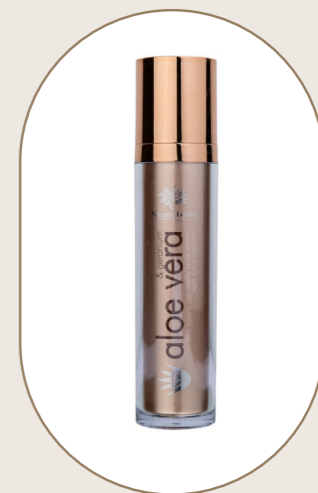
Aloe Vera + Geranium Regenerative Moisturiser 100 ml - 3.4 fl.oz

Hydrating and moisturising lotion improves skin tone and radiance. Sun protection has been included to help guard against the sun's damaging rays. Apricot oil, Jojoba oil, and Shea Butter are all high in nutrients and have anti-inflammatory properties.