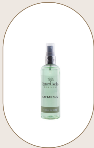
Safari Duo Body Spray 150ml - 5.1fl.oz