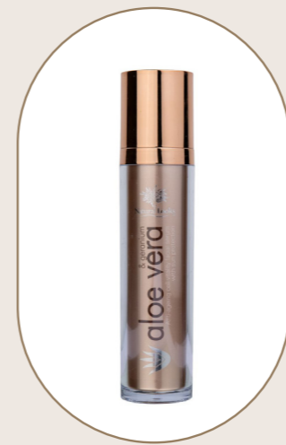
Aloe Vera + Geranium Anti-Ageing Serum 100 ml - 3.4 fl.oz

Finest organic rosewater distilled from fresh petals of organically grown roses. This is a wonderful soothing and hydrating toner