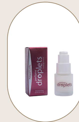
Happiness Perfume Droplets 20 ml - 0.7 fl.oz

Perfumed moisturising cream droplets with a fluid formula that absorbs easily. Perfumes the skin with delicate notes of red lychee, jasmine, orchid, musks and woods.