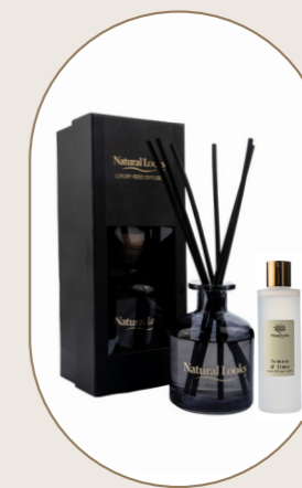
Lemon & Lime Reed Diffuser 200ml - 6.7 fl.oz