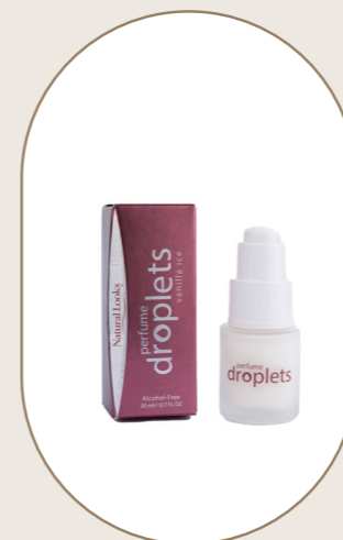
Vanilla Ice Perfume Droplets 20 ml - 0.7 fl.oz

Perfumed moisturising cream droplets with a fluid formula that absorbs easily. Perfumes the skin with delicate seductive notes of white musk.