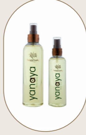
Yanaya Body Spray 250ml/150ml - 8.5/5.1fl.oz