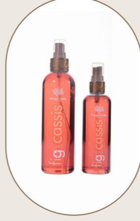
Fig & Cassis Body Spray 250ml/150ml - 8.5/3.4fl.oz