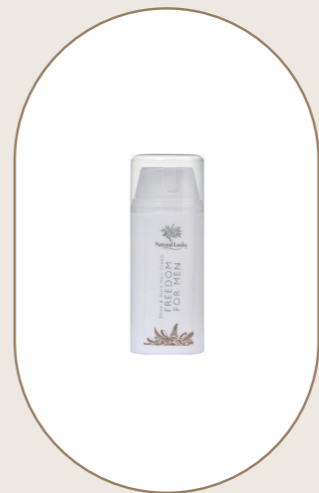
Freedom Shine & Styling Hair Cream 100 ml - 3.4 fl.oz

An invigorating Shower Gel designed to refresh and revitalize with a lush, woody fragrance. Contains natural Rosemary Extract with natural astringent qualities.