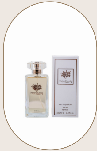
Illusion Eau De Parfum 100 ml - 3.4 fl.oz

Compact, unspillable and alcohol-free makes this longlasting sensuous solid perfume ideal for your handbag or travelling. Available in 6 other fragrances.