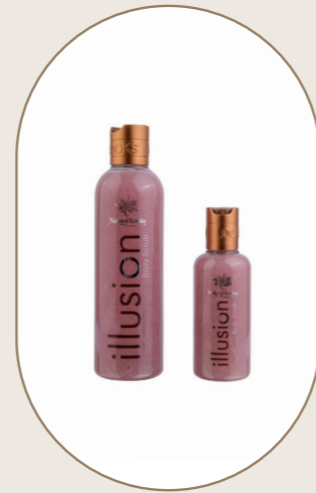
Illusion Body Scrub 250ml/100ml - 8.5/3.4fl.oz

A rich foaming, Cream Bath with a soft and sensual fragrance. Contains natural extract which helps soothe and soften irritated skin as well as helping to relax tired muscles.