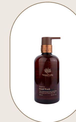
Elegance Hand Wash 300ml - 10.14 fl.oz

Wet Hands, lather up, and rinse away for clean, soft hands that smell divine. Deep cleansing gel that moisturises and leaves your hands silky soft.