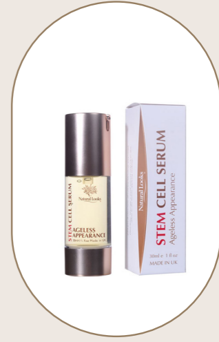
Stem Cell Facial Serum 30 ml - 1 fl.oz

Instant Skin Hydrator This super serum delivers long-lasting hydration to your skin, making it your new daily go-to. The formula not only gives instant plump skin but it is also anti-ageing and reduces visibility of fine lines.