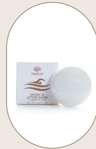
Sport & After Swim Shampoo bar 50g - 1.7 oz

A long lasting shampoo in a convenient bar which is easy to carry and won't leak or spill. Contains an infusion of rosemary, lavender and nettle to help neutralize the effects of chlorine and sweat.