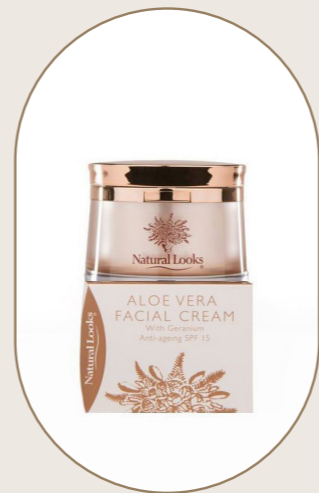
Aloe Vera Facial Cream 50 ml - 1.7 fl.oz

A nourishing skin whitener, which helps lighten the skin naturally and gently, giving you a healthy, evenly balanced skin tone. It helps remove dark dead skin cells and reduce skin darkening.