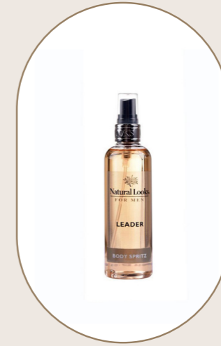
Leader Body Spray 150ml - 5.1fl.oz