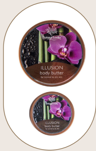
Illusion Body Butter 220ml/60ml - 7.5/2.03 fl.oz

Handy sized, non-stick, roll-on deodorant designed to give all day freshness with the light refreshing fragrance of Illusion.