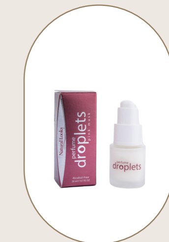
Pink Musk Perfume Droplets 20 ml - 0.7 fl.oz

Perfumed moisturising cream droplets with a fluid formula that absorbs easily. Perfumes the skin with rich notes of sandalwood and amber for a sweetened sensual and woody fragrance.