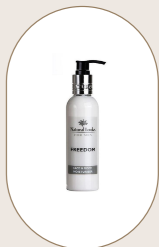
Freedom Face & Body Moisturiser 250 ml - 8.5 fl.oz

A non-sticky anti-perspirant designed to give all day freshness with the refreshing, masculine fragrance. Contains Rosemary extract with natural astringent qualities.