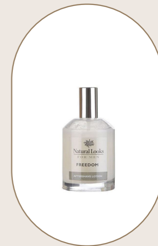
Freedom Aftershave Lotion 100 ml - 3.4 fl.oz

Specially formulated to soften the facial hair and moisturise the skin for an extra smooth shave with a lush, woody fragrance of freedom for men.