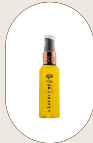
Vitamin E Oil 75 ml - 2.5 fl.oz

Due to its emollient and non-irritating properties, this oil is suitable for all skin types. Especially good for chapped hands, for general massage and as a carrier oil.