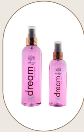
Dream Body Spray 250ml/150ml - 8.5/3.4fl.oz