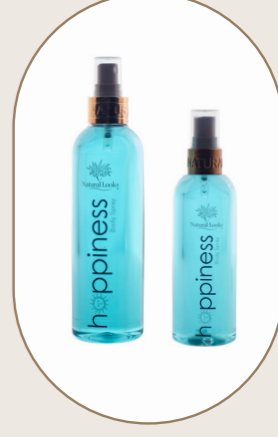
Happiness Body Spray 250ml/150ml - 8.5/3.4fl.oz