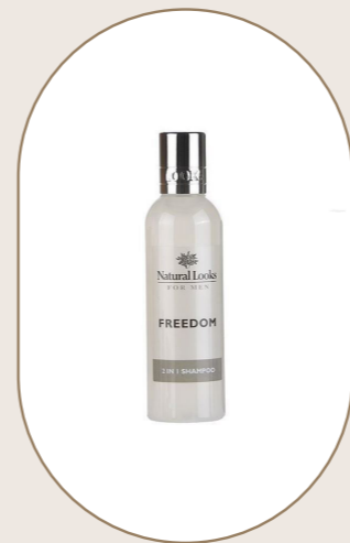
Freedom 2 in 1 Shampoo 250 ml - 8.5 fl.oz

A lush, woody fragrance with warm amber notes in a revitalizing Body Spray to cool and refresh your body without drying your skin.