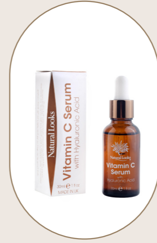
Vitamin C Facial Serum 30 ml - 1 fl.oz

Vitamin C helps fade skin pigmentation and leads to a more even toned glowing complexion. Hyaluronic acid is a powerful hydrator. Together they help plump and rejuvenate, giving a bright youthful appearance.