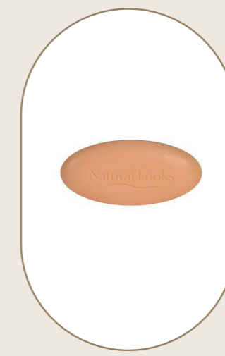
Honey Soap 150g

A floral fragranced vegetable soap to gently cleanse and protect the skin. Contains natural Chamomile Flower extract with anti-inflammatory and soothing qualities, excellent for irritated skin.