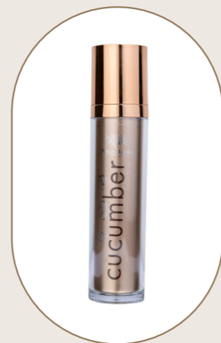
Cucumber Moisturiser 100 ml - 3.4 fl.oz

Moisturising Facial Cream containing Sweet Almond Oil, Comfrey and Chamomile Extracts, Vitamin E and Aloe Vera with sun protection factor 25.