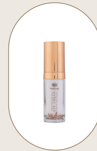
Eye Cream Advanced Clear Skin 20 ml - 0.68 fl.oz

This gentle Face Mask cleanses and purifies your skin leaving it soft, fresh and toned. Contains Sweet Almond Oil, Chamomile Extract and Oatmeal. Suitable for all skin types.