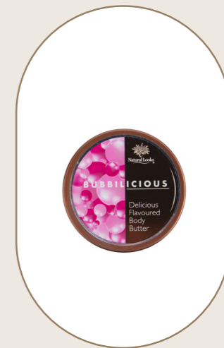
Bubbilicious Delicious Body Butter 60 ml - 2 fl.oz

Delicious bubblegum flavoured moisturising lotion is full of natural oils to make your skin irresistibly soft and delectable.