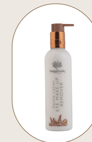
Gentle Lotion Eye Make-Up Remover Lotion 250 ml - 8.5 fl.oz

Specially formulated with vitamin E to care for the sensitive area around the eyes. Effectively removes even waterproof make-up.