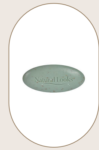
Tea Tree Scrub Soap 150g

A gently cleansing and hydrating vegetable soap which helps protect the skin from over drying. Fragranced with soothing and relaxing lavender.