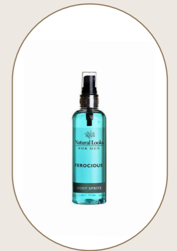
Ferocious Body Spray 150ml - 5.1fl.oz