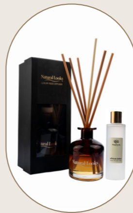
African Juice Reed Diffuser 200ml - 6.7 fl.oz