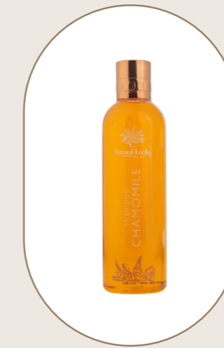
Chamomile Shampoo 250 ml - 8.5 fl.oz

A luxurious shampoo with moisturising Moroccan argan oil to revitalise & strengthen each strand creating silky smooth softness. The SLS-free formulation is especially mild ensuring maximum benefit.