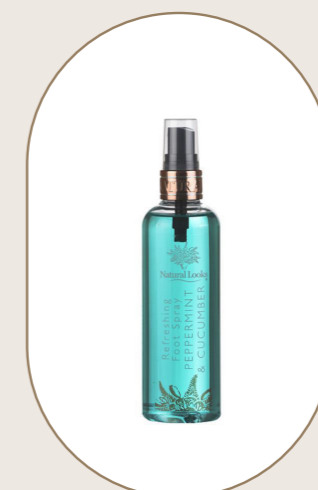
Peppermint & Cucumber Foot Spray 150 ml - 5.07 fl.oz

A rich, creamy lotion to help moisturise and soften your skin. Menthol, Peppermint and Cucumber extracts to help cool, refresh and revitalize tired, weary feet, and help combat foot odour.