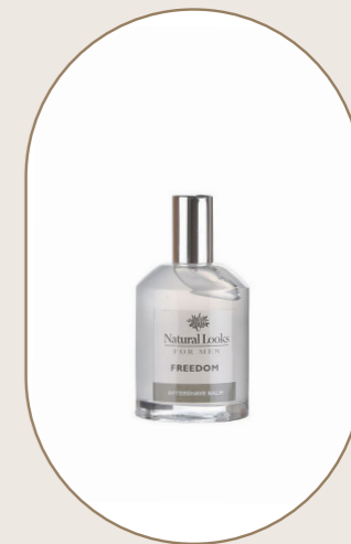
Freedom Aftershave Balm 100 ml - 3.4 fl.oz

A non-greasy lotion for daily use containing Jojoba Oil and Shea Butter to moisturise and protect, natural Rosemary Extract with natural astringent qualities. Suitable for face & body.