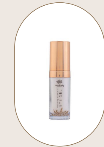
Vitamin E Uplifting Eye Gel 20 ml - 0.68 fl.oz

Soothing Cucumber Eye Gel cools and refreshes the skin around your eyes. Especially good for tired, sore or puffy eyes.