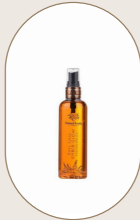
Amber Glow Body Spray 150ml - 5.1fl.oz