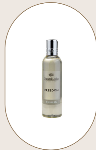
Freedom Shower Gel 250 ml - 8.5 fl.oz

Men's fragrance. Green and woody with warm amber notes in a long lasting fragrance. Available in 9 other fragrances.