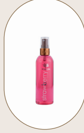
Strawberry Body Spray 150ml - 5.1fl.oz