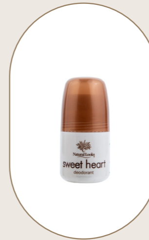
Sweet Heart Deodorant 50ml - 1.7 fl.oz

Our deodorants come in a range of convenient formats and formulations, catering to diverse preferences and skin types. Handy roll-on anti-perspirants provide all-day freshness with light, refreshing fragrances, while solid stick options offer odour-absorbing properties and are free from aluminum and alcohol, and spray deodorants work with natural crystal mineral salts which form a protective barrier against odour-causing bacteria. Scented options like Sweet Strawberry and Cucumber Melon feature invigorating, natural fragrances combined with soothing ingredients like aloe vera and honeysuckle extract for lasting protection. Additionally, unscented formulations made from 100% natural ingredients ensure effective odour protection without added fragrances, making them suitable for anyone looking for a gentle, unisex option.