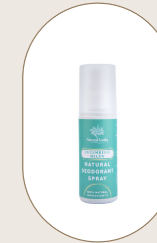
Cucumber Melon Natural Deodorant Spray 100 ml - 3.4 fl.oz

Natural deodorant spray with the invigorating scent of fresh strawberries, complemented by undertones of orange and black pepper. Crafted with 100% natural ingredients, including the soothing effects of aloe vera and magnesium.