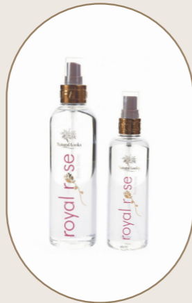
Royal Rose Body Spray 250ml/150ml - 8.5/5.1fl.oz