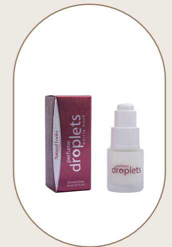
Purity Musk Perfume Droplets 20 ml - 0.7 fl.oz

Perfumed moisturising cream droplets with a fluid formula that absorbs easily. Perfumes the skin with delicate notes of pink pineapple and orange combined with a heart of exotic flowers.