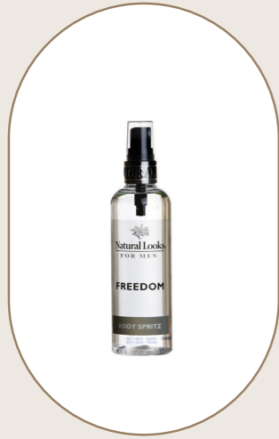
Freedom Body Spray 150ml - 5.1fl.oz