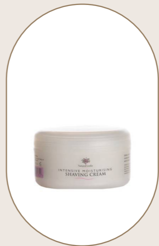
Freedom Moisturising shaving cream 100 ml - 3.4 fl.oz

A conditioning styling product that adds shine whilst also controlling fly-away hair without being heavy or leaving a stick residue. Enriched with Jojoba Oil, Beeswax and Wheat Protein.