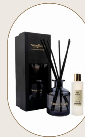
Amber & Sandalwood Reed Diffuser 200 ml - 6.7 fl.oz