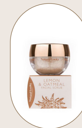
Lemon & Oatmeal Facial Scrub 47 ml - 1.58 fl.oz

The antiseptic qualities of Tea-Tree and Lemon Oils combine with Lavender, Rosemary and Chamomile Oils to naturally soothe and heal spots and blemishes.