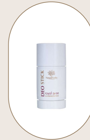
Royal Rose Deo stick 75ml - 2.54 fl.oz

Handy sized, non-stick, roll-on anti-perspirant deodorant designed to give all day freshness with a light refreshing fragrance. Available in 12 other fragrances.