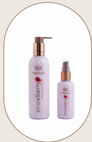
Strawberry Delicious Body Lotion 250ml/100ml - 8.5/3.4fl.oz

Delicious berry fruit flavoured moisturising lotion is full of natural oils to make your skin irresistibly soft and delectable.