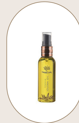
Jojoba Oil 75 ml - 2.5 fl.oz

This rich oil, containing Wheatgerm Oil, Algae extract, and Vitamin E, is a powerful anti-oxidant, used to help prevent wrinkles and fight the ageing process.