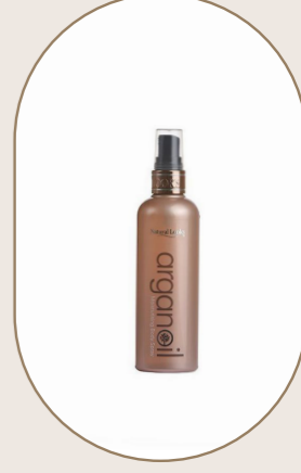
Argan Oil Body Spray 150ml - 5.1fl.oz