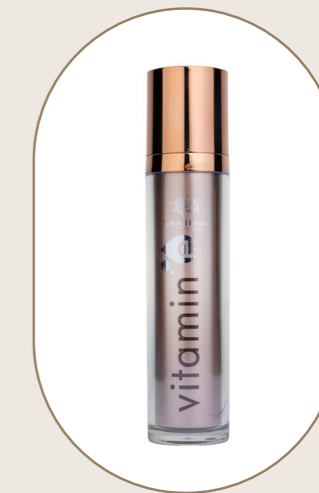
Vitamin E Facial Cleanser 100 ml - 3.4 fl.oz

A highly effective pore cleanser with natural antiseptic. Overdry your skin. Contains tea-tree, lavender and salicylic acid to combat excess facial oil, acne and blemishes and Vitamin E helps soothe the skin