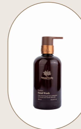
Paris Hand Wash 300ml - 10.14 fl.oz

Wet Hands, lather up, and rinse away for clean, soft hands that smell divine. Exfoliating, deep cleansing gel that moisturises and leaves your hands silky soft.