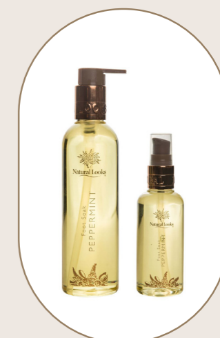
Peppermint Foot Soak 250ml/100ml- 8.5/3.4fl.oz

Instantly refresh hot, tired, weary feet with this cooling peppermint, menthol and cucumber spray. Also helps combat foot odour.