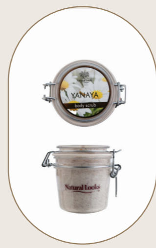
Yanaya Body Scrub 230ml - 7.8 fl.oz

We offer a range of benefits for skin care, combining gentle exfoliation with moisturising properties. Body scrubs featuring natural ingredients like olive stone and oat flour help remove dead skin and stimulate new growth. Creamy vegetable soaps are designed to cleanse while retaining moisture, with formulations that include soothing chamomile and honey for their anti-inflammatory and antibacterial qualities.