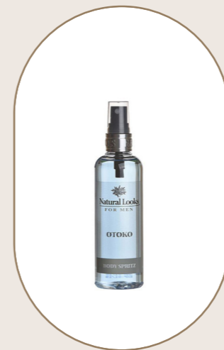
Otoko Body Spray 150ml - 5.1fl.oz