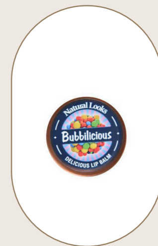
Bubbilicious Delicious Lip Balm 10 ml - 0.34 fl.oz

Creamy moisturising body butter enhanced with luscious chilled cheeky cherry flavour. Add fragrance and softness to your skin and create a luxurious sensuous experience.