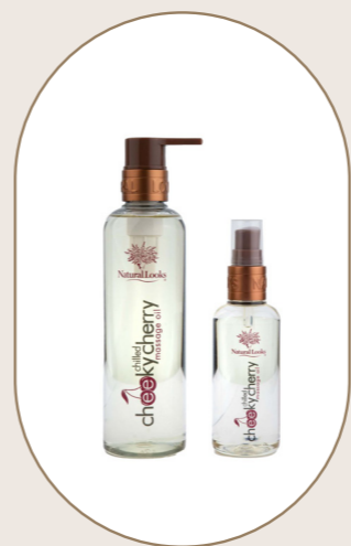
Chilled Cheeky Cherry Massage Oil 250ml/100ml - 8.5/3.4fl.oz

Our sweet tasting, black berry flavoured delicious lip balm is ideal for moisturising the lips. Glow with soft, luscious plump lips.