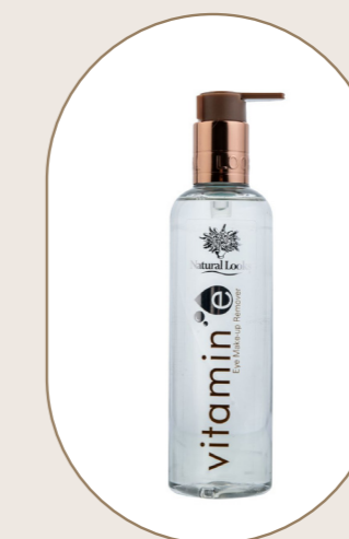
Vitamin E Eye Make-Up Remover Liquid 250 ml - 8.5 fl.oz

Removes make-up quickly and easily. Unclogs pores and draws out impurities. Tones, soothes and refreshes even sensitive skin.