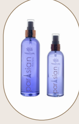
Parisian Body Spray 250ml/150ml - 8.5/3.4fl.oz