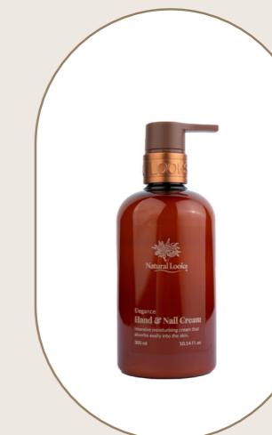
Elegance Hand & Nail Cream 300 ml - 10.14 fl.oz

Intensive moisturising cream that absorbs easily into the skin Apply regularly to moisturise and lock in hydration for soft, smooth hands and stronger nails.