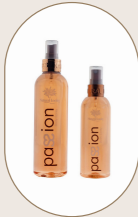
Passion Body Spray 250ml/150ml - 8.5/3.4fl.oz