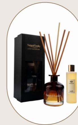
Vanilla Reed Diffuser 200ml - 6.7 fl.oz