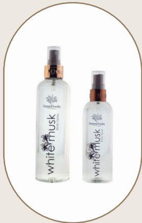
White Musk Body Spray 250ml/150ml - 8.5/5.1fl.oz