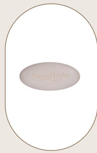
Buttermilk Soap 150g

A moisturising lotion containing natural olive stone and oat flour to gently exfoliate the skin. Contains natural mango extract to soothe and cool the skin.