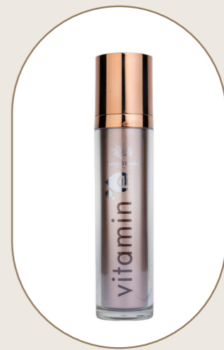
Vitamin E Facial Toner 100 ml - 3.4 fl.oz

The combination of witch hazel and cucumber extract clarifies the pores and prevents a build-up of impurities on the skin's surface.