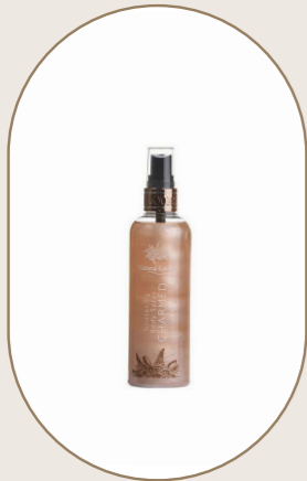
Charmed Glistening Body Spray 150ml - 5.1fl.oz