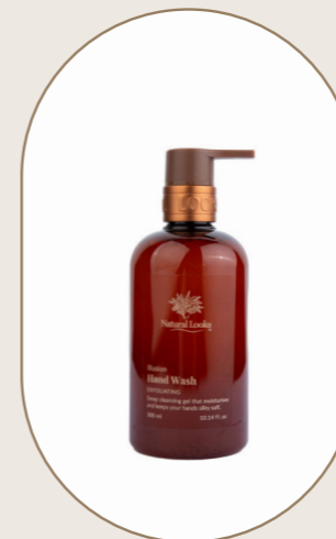
Illusion Hand Wash 300ml - 10.14 fl.oz

Elevate your hand care routine with a luxurious duo designed for silky soft hands and stronger nails. The deep cleansing gel effectively removes impurities while moisturising, leaving your hands feeling fresh and rejuvenated. Follow with the intensive moisturising cream, which absorbs effortlessly into the skin, ensuring long-lasting hydration and smoothness. When paired together, the hand wash and hand & nail cream create the ultimate hand-spa experience, transforming your daily routine into a pampering ritual that nurtures both your skin and nails. The elegant amber bottles add a touch of sophistication to your sink counter, making them a beautiful addition to your space.