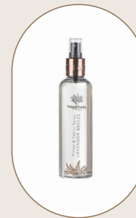
Lavender Breeze Pillow & Fabric Spray 250 ml - 8.5 fl.oz