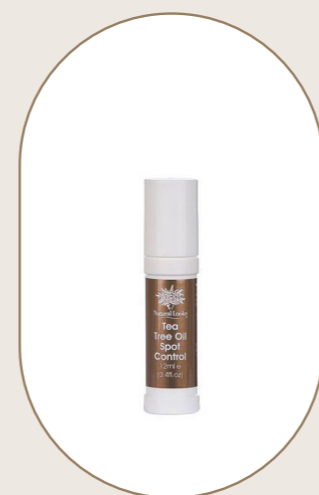
Tea Tree Spot Control 12 ml - 0.4 fl.oz

The antiseptic qualities of Tea-Tree and Lemon Oils combine with Lavender, Rosemary and Chamomile Oils to naturally soothe and heal spots and blemishes.