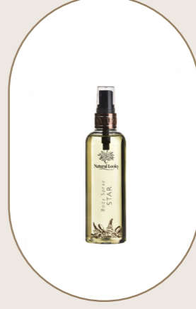
Star Body Spray 150ml - 5.1fl.oz