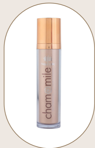
Camomile Moisturiser 100 ml - 3.4 fl.oz

This combination of almond oil, jojoba oil and shea butter is rich in vitamins and antioxidants providing intensive hydrating and moisturising. Sun screen is important to help protect your skin and keep it soft and young looking.