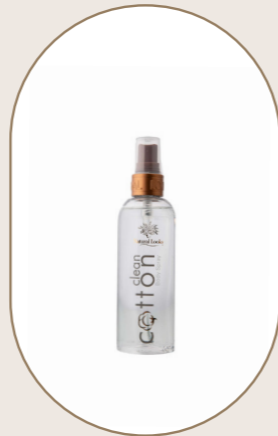
Clean Cotton Body Spray 150ml - 5.1fl.oz