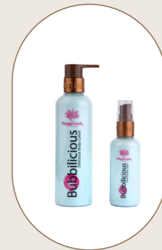
Bubbilicious Delicious Body Lotion 250ml/100ml - 8.5/3.4fl.oz

Delicious chilled cheeky cherry flavoured moisturising lotion is full of natural oils to make your skin irresistibly soft and delectable.