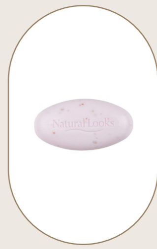
Rosewater Scrub Soap 150g

A super soothing vegetable based soap which contains natural honey with its anti-bacterial and anti-ageing qualities. It is extremely moisturising and gives the skin an extra boost to create a clear, glowing complexion.