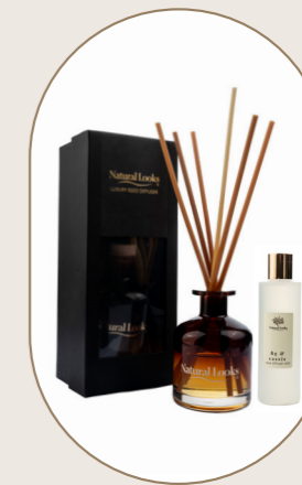
Fig & Cassis Reed Diffuser 200ml - 6.7 fl.oz