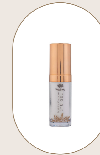
Cucumber Soothing Eye Gel 20 ml - 0.68 fl.oz

Targets fine lines and loss of elasticity, reviving firm youthful skin. Provides essential moisture and hydration without greasiness to the delicate eye area.