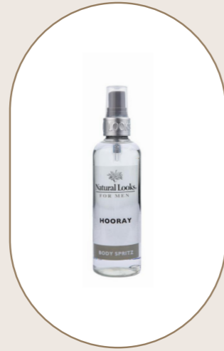
Hooray Body Spray 150ml - 5.1fl.oz