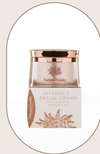
Vitamin E Facial Cream 50 ml - 1.7 fl.oz

A creamy, nourishing cream that is rich in natural extracts to help reduce fine facial lines and regenerate skin cells. Also contains SPF for daily sun protection.