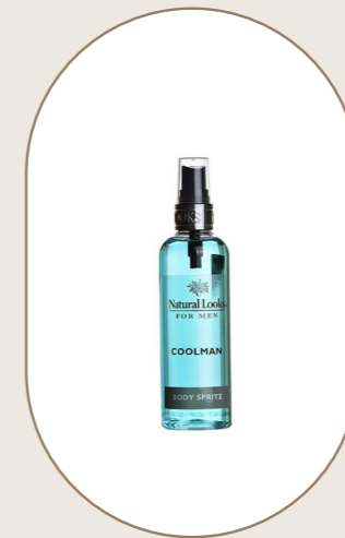
Coolman Body Spray 150ml - 5.1fl.oz