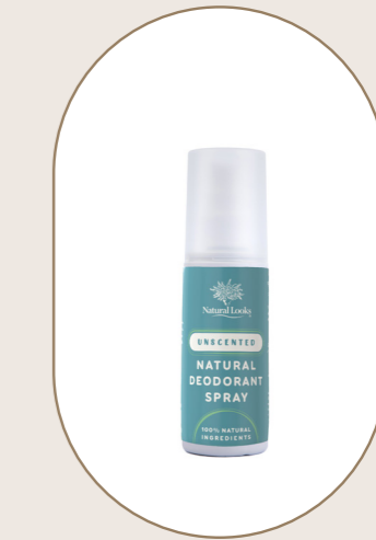
Unscented Natural Deodorant Spray 100 ml - 3.4 fl.oz

Made from 100% natural ingredients, including natural mineral salts, aloe vera, and honeysuckle extract. the unique combination of ingredients provide long-lasting protection.