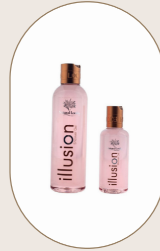
Illusion Shower Gel 250ml/100ml - 8.5/3.4fl.oz

This Body Scrub gel exfoliates the old skin and stimulates the new. Also contains natural anti-oxidants which boost youthful radiance. Lightly fragranced.