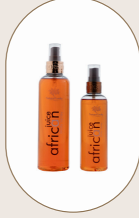
African Juice Body Spray 250ml/150ml - 8.5/3.4fl.oz