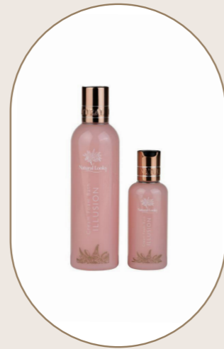
Illusion Cream Foam Bath 250ml/100ml - 8.5/3.4fl.oz

Pamper your body with this rich nourishing cream to moisturise; enhanced by natural anti-oxidants to boost a healthy, radiant skin. Lightly fragranced.