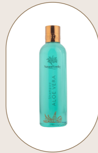
Aloe Vera Shampoo 250 ml - 8.5 fl.oz

A gentle shampoo that cleanses without stripping your hair of natural oils, restoring life and vitality to all hair types. Contains natural Aloe Vera which helps cool and soothe itchy or irritated scalps.