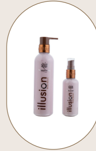
Illusion Body Serum 250ml/100ml - 8.5/3.4fl.oz

A refreshing and revitalizing fragrant Shower Gel, which contains natural Bamboo Shoot Extract which has antioxidant and cleansing properties.