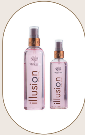
Illusion Body Spray 250ml/150ml - 8.5/3.4fl.oz