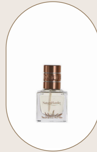
Illusion Perfume Oil 15 ml - 0.5 fl.oz

Intensive soft and sensual fragrance. Dab on to neck and wrists. Available in many fragrances.