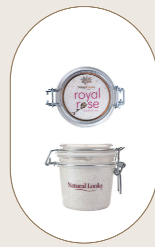
Royal Rose Body Scrub 230ml - 7.8 fl.oz

This body scrub contains natural olive stone and oat flour to gently exfoliate the old skin and stimulate the new. Contains natural chamomile extract to your skin.