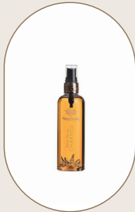
Charmed Body Spray 150ml - 5.1fl.oz