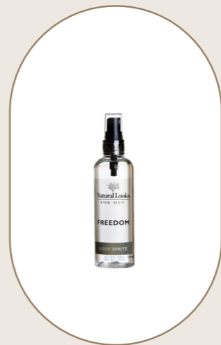
Freedom Body Spritz 150 ml - 5.1 fl.oz

A lush, woody fragrance with warm amber notes in a revitalizing Body Spray to cool and refresh your body without drying your skin.