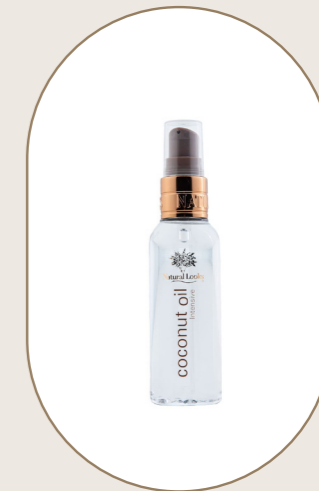
Coconut Oil 75 ml - 2.5 fl.oz

Jojoba oil is an excellent lubricant. Use it to soften & moisturise your skin, helping reduce wrinkles, stretchmarks and scars. A protective film is created over skin & hair.