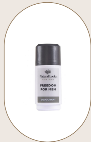
Freedom Deodorant 50 ml - 1.7 fl.oz

A specially formulated Shampoo with a built-in conditioner with a woody fragrance. Contains natural Rosemary Extract which stimulates the scalp helping to promote healthy hair.