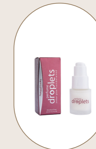
Amber glow Sandalwood Perfume Droplets 20 ml - 0.7 fl.oz

Perfumed moisturising cream droplets with a fluid formula that absorbs easily. Perfumes the skin with a rich, warm, mellow vanilla fragrance.