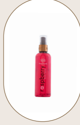
Raspberry Body Spray 150ml - 5.1fl.oz