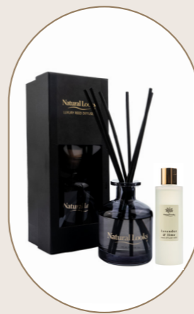
Lavender & Lime Reed Diffuser 200ml - 6.7 fl.oz