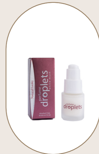
White Musk Perfume Droplets 20 ml - 0.7 fl.oz

Perfumed moisturising cream droplets with a fluid formula that absorbs easily. Perfumes the skin with blended notes of pink pepper, rose petals, raspberry blossom and fresh white amber.