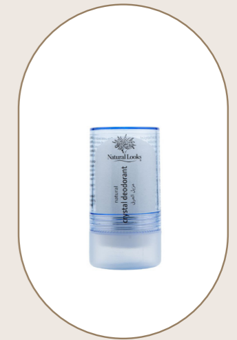
Crystal Deodorant Natural Crystal 115g

Easy to use solid stick with odour absorbing properties to help keep you fresh all day long. Aluminium free and alcohol free. Available in 3 other fragrances.