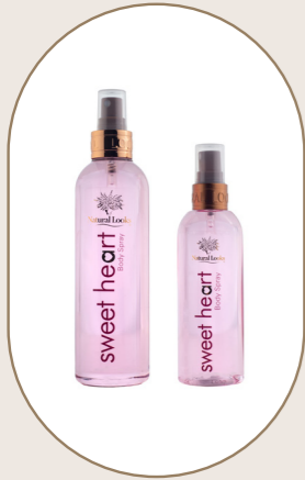
Sweet Heart Body Spray 250ml/150ml - 8.5/3.4fl.oz