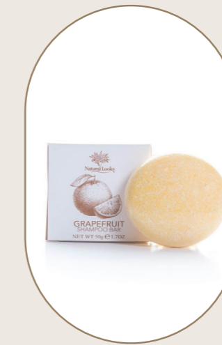
Grapefruit Shampoo Bar 50g - 1.7 oz

A long lasting shampoo in a convenient bar which is easy to carry and won't leak or spill. Contains an infusion of rosemary, lavender and nettle to help neutralize the effects of chlorine and sweat.