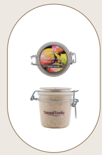
African Juice Body Scrub 230ml - 7.8 fl.oz

A moisturising lotion Scrub containing olive stone to exfoliate the old skin and stimulate the new.