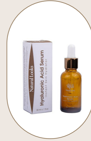
Hyaluronic Acid Facial Serum 30 ml - 1 fl.oz

Vitamin C helps fade skin pigmentation and leads to a more even toned glowing complexion. Hyaluronic acid is a powerful hydrator. Together they help plump and rejuvenate, giving a bright youthful appearance.