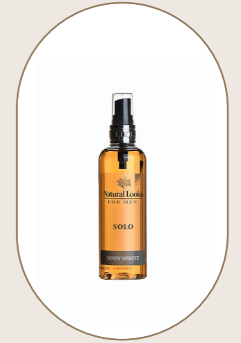
Solo Body Spray 150ml - 5.1fl.oz