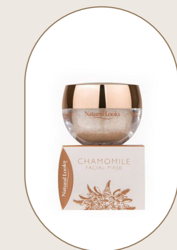
Camomile Face Mask 47 ml - 1.58 fl.oz

Gently clears blocked pores and promotes new, healthy skin. Contains Lemon Essential Oil, Oatmeal and Olivestone. Suitable for all skin types.