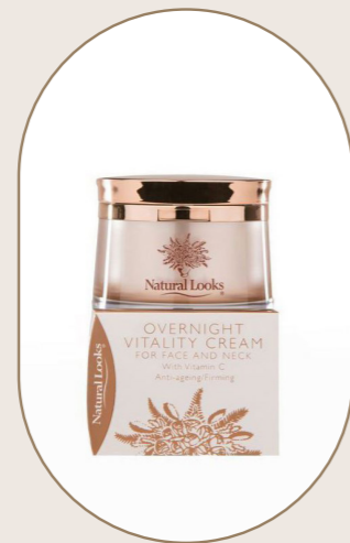
Overnight Vitality Cream for Face & Neck 50 ml - 1.7 fl.oz

The creams and moisturizers discussed offer a variety of benefits aimed at improving skin health and appearance. They target issues such as signs of aging, uneven skin tone, and hydration while providing sun protection. Formulations include natural ingredients that nourish and soothe the skin, making them suitable for various skin types. Overall, these products work together to enhance radiance, maintain moisture, and promote a youthful complexion.