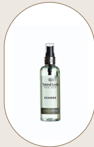
Echoes Body Spray 150ml - 5.1fl.oz