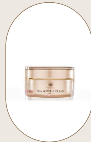
Sunscreen Cream 250 ml - 8.5 fl.oz

A creamy, nourishing cream that is rich in natural extracts to help reduce fine facial lines and regenerate skin cells. Also contains SPF for daily sun protection.