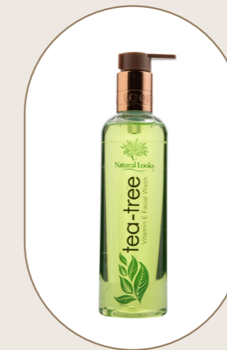
Tea Tree + Vitamin E Facial Wash 250 ml - 8.5 fl.oz

A refreshing, cool cleanser with cucumber extract. Gently removes daily grime and make-up without the need to scrub and without irritating the skin. For Combination/Oily Skins