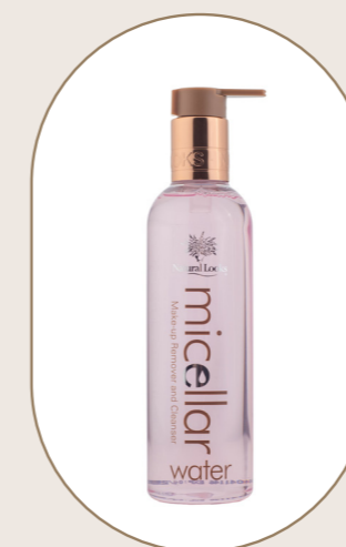
Micellar Water Make-Up Remover & Cleanser 250 ml - 8.5 fl.oz

Gently removes daily grime and make-up without the need to scrub and without irritating the skin. Rich in Vitamin E to help reduce moisture loss. For Normal/Dry Skin