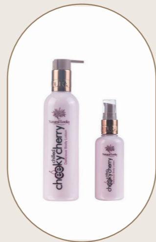
Chilled Cheeky Cherry Delicious Body Lotion 250ml/100ml - 8.5/3.4fl.oz

Delicious strawberry fruit flavoured moisturising lotion is full of natural oils to make your skin irresistibly soft and delectable.